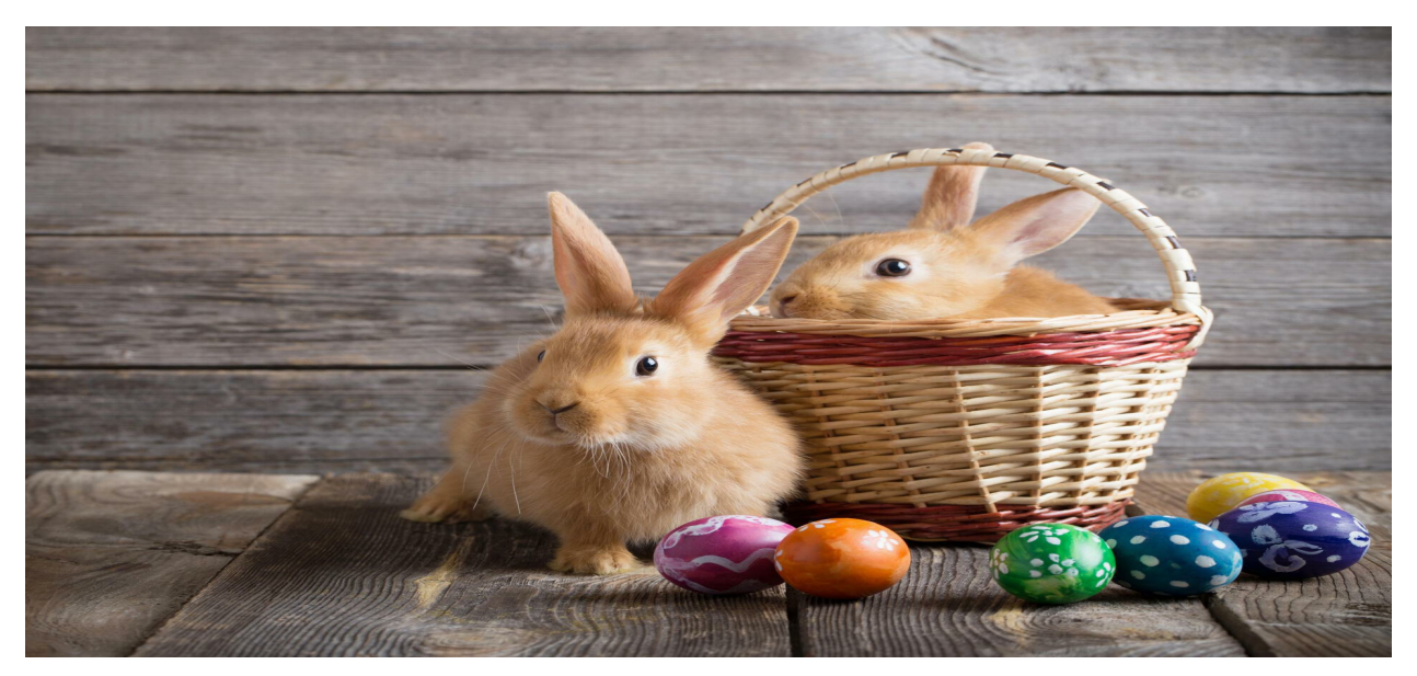
5. Rabbit Enrichment

W ithout enrichment, all animals - including humans - would bore themselves to death! Rabbits are no exception and require appropriate forms of enrichment to keep them mentally stimulated and happy.